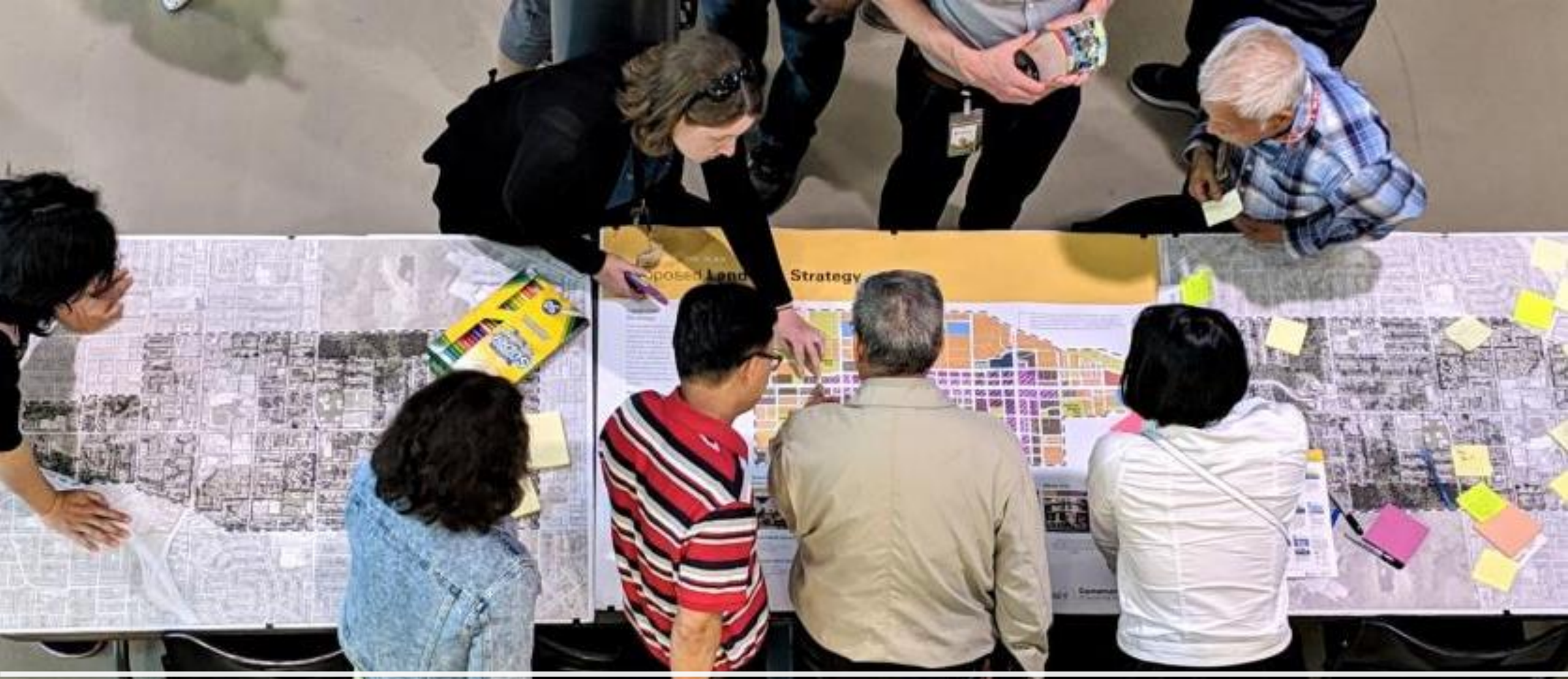
Sustainability Committee Update to BOC January 11, 2022